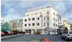
Snaps – Bistro Þórgata 1, 101 Reykjavík