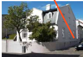
Hannesarholt Grundarstígur 10, 101 Reykjavík